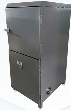
HEAT PUMP TYPE